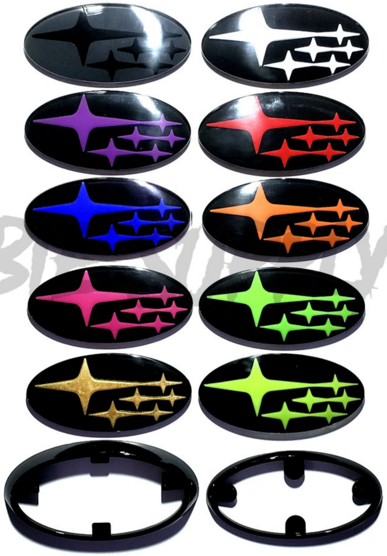
Red And Black Light Up Subaru Badge